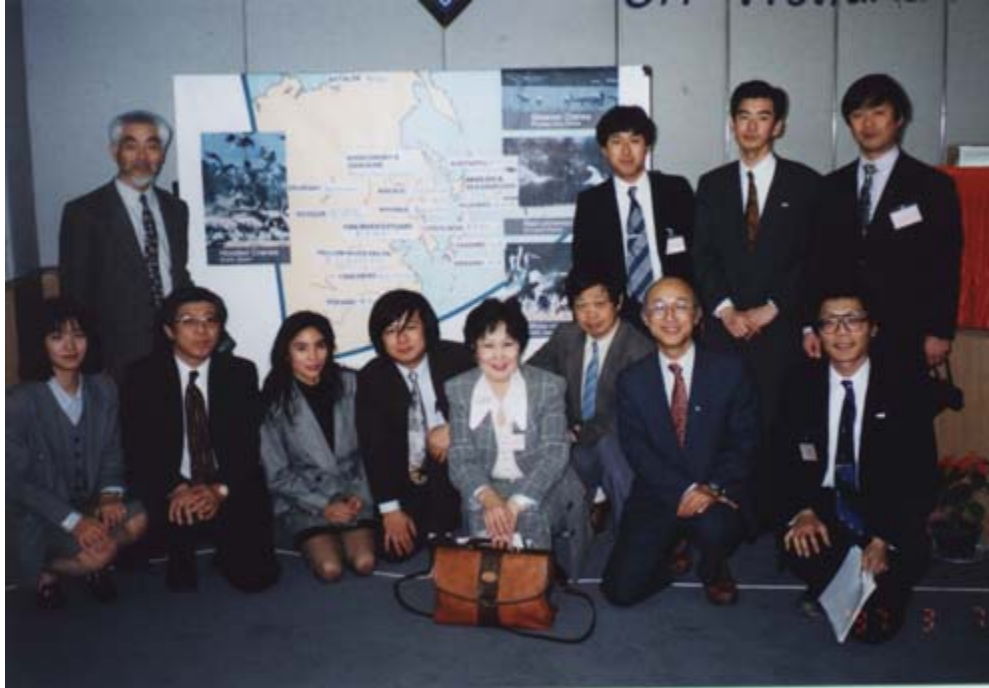
Launch of the Crane Network, Beidaihe, China, March 1997.

Theme of this issue: What is the North East Asian Crane Site Network?