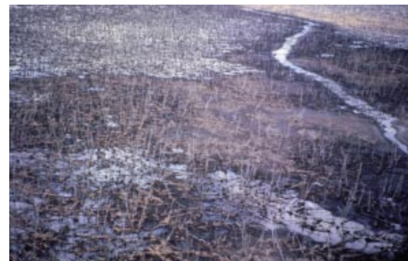
Saltwater intrusion has severely degraded vast areas of the Mary River floodplain in tropical northern Australia. Natural barriers along the coast that once protected the floodplain from saline intrusion have been degraded, leaving this area extremely vulnerable to sea level rise due to climate change (CM Finlayson).