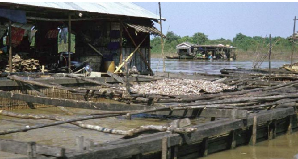
National wetland inventories can contain much information including the benefits and values of wetlands, allowing improved management and wise use of wetlands. This fish cage in Cambodia demonstrates the vital role of wetlands in providing food, water and a livelihood for people worldwide (CM Finlayson).

and Western Europe. Regional reviews were based primarily on national inventories, although sub-national reviews were used where these covered a large area or a major administrative zone. We also conducted a review of continental and global scale inventory sources to supplement the regional reviews.