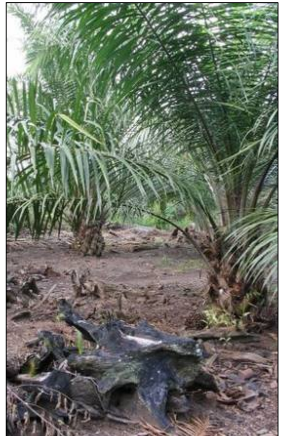
Oil palm estate in former peatswamp forest