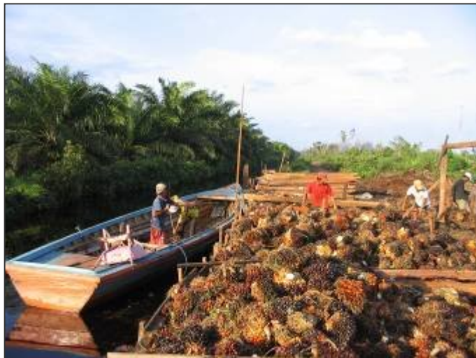
Oilpalm harvest Sungai Gelam, Jambi

By conservative estimate about 25% of all Malaysian and Indonesian palm oil plantations are now on peatlands; new plans aim at further expansion of palm oil plantations especially on peatlands. In Indonesia already 14% of the peatlands are used or earmarked for palm oil production. Over 50% of new plantations are planned in these peatlands.