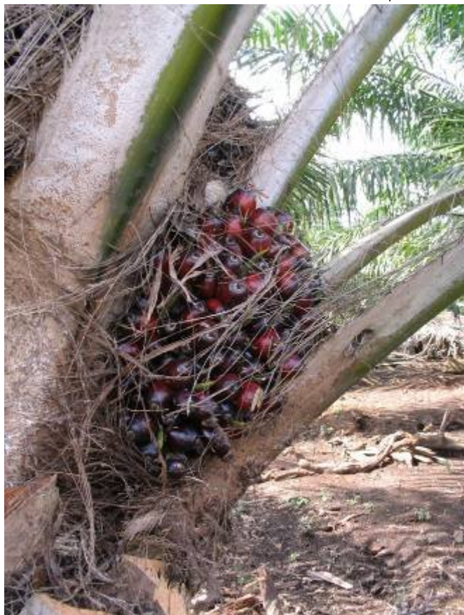
Oil palm fruit