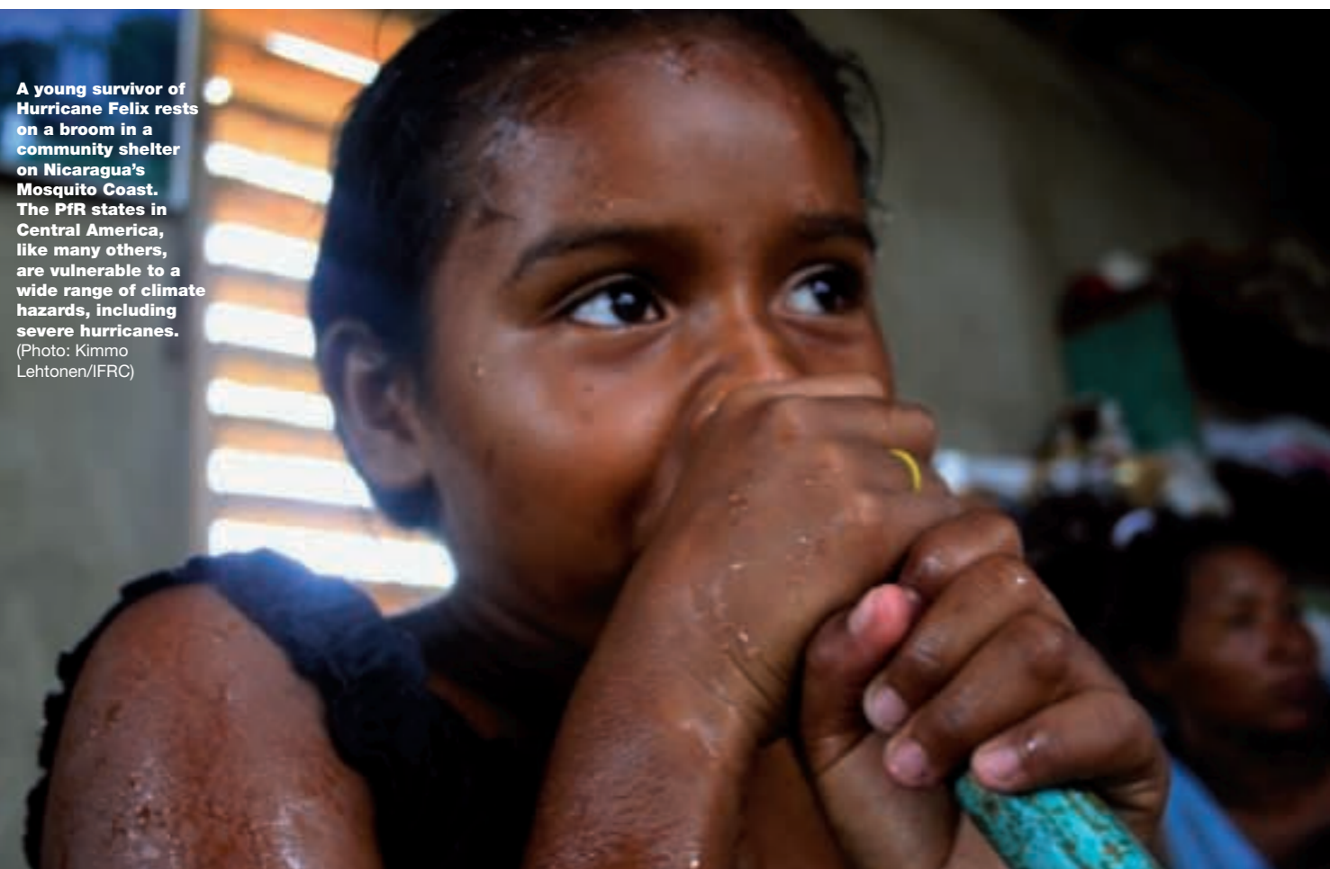
A young survivor of Hurricane Felix rests on a broom in a community shelter on Nicaragua’s Mosquito Coast. The PfR states in Central America, like many others, are vulnerable to a wide range of climate hazards, including severe hurricanes.