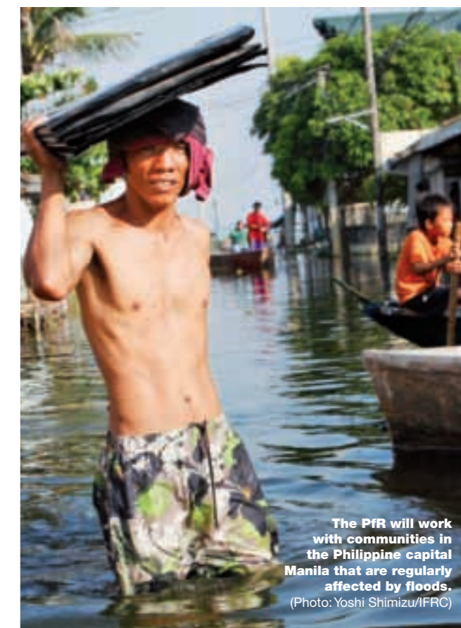
The PfR will work with communities in the Philippine capital Manila that are regularly affected by floods.

To improve this situation, five Netherlands-based humanitarian, development and environmental organizations, with support from the Dutch Ministry of Foreign Affairs, have formed an alliance to reduce the impact of hazards on vulnerable communities. They are the Netherlands Red Cross, the Red Cross Red Crescent Climate Centre, CARE Nederland, Cordaid, and Wetlands International: the "Partners for Resilience" (PfR).