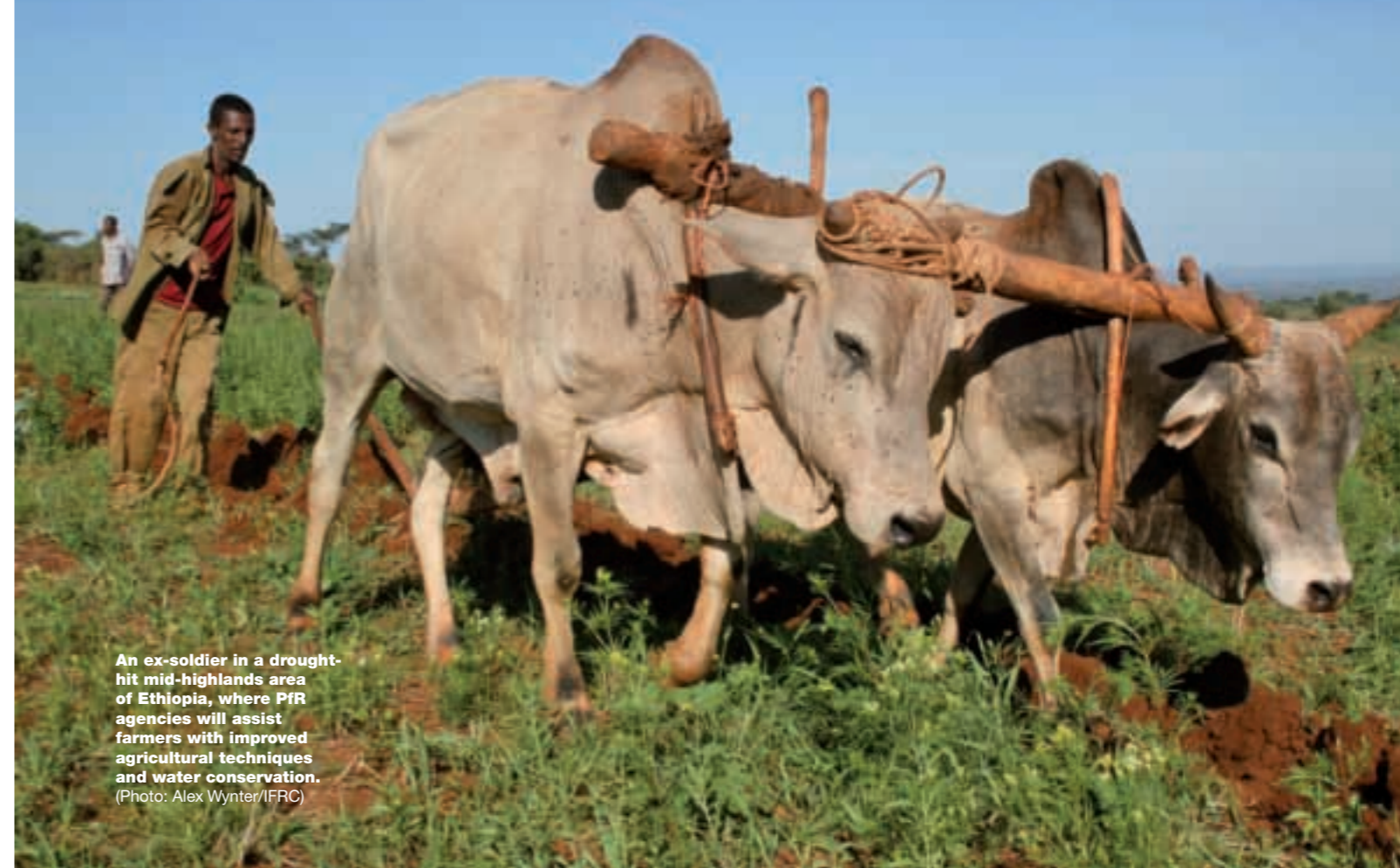
An ex-soldier in a drought-hit mid-highlands area of Ethiopia, where PfR agencies will assist farmers with improved agricultural techniques and water conservation.

experience to bear on risk reduction there. “For example, our existing DRR programme takes account of climate trends. We’re working across a wide range of activities and timescales – from emergency planning that incorporates climate-change projections to helping people adjust farming technologies.”