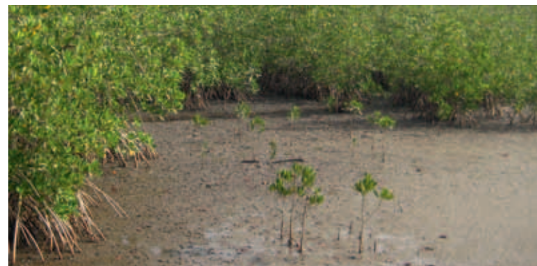
Mangroves (such as here in the Saloum Delta, Senegal) store huge amounts of carbon in their roots and soil; their protection and restoration offer a cost-effective option for offsetting emissions.

The degradation of carbon rich wetlands worldwide contributes around 2 Giga tonnes of CO 2 equivalents per annum, or 6 % of global greenhouse gas (GHG) emissions. The largest concentration of emissions result from the conversion, drainage and burning of peatlands, especially in the tropics. In the past, efforts to reduce global GHG emissions have been almost solely focused on fossil fuel use. Some attention has been