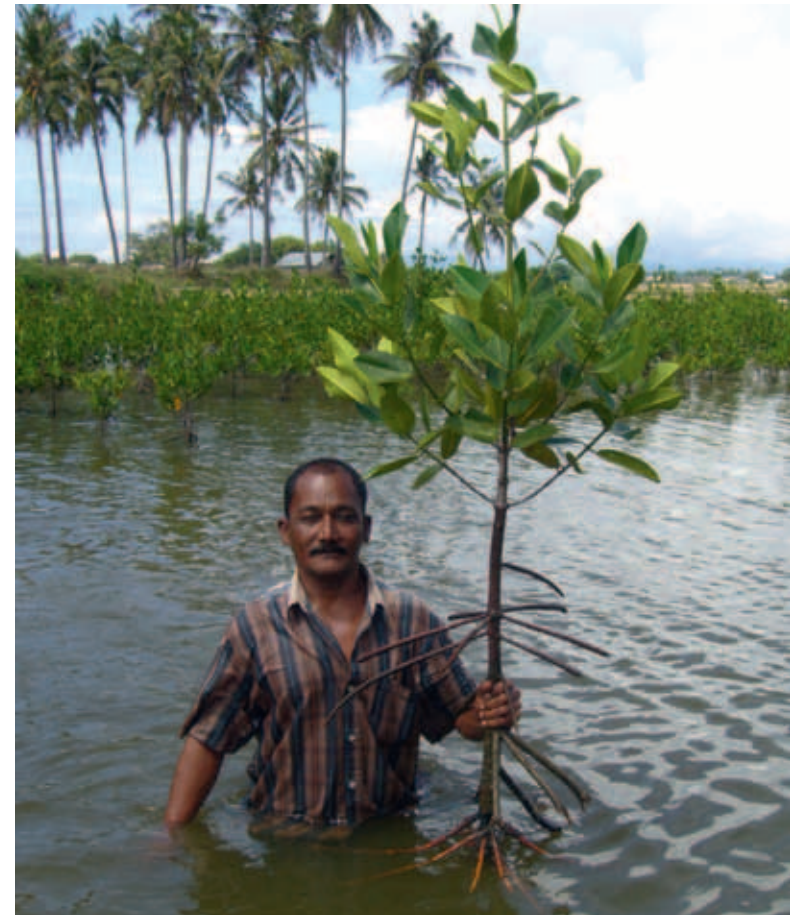
Through restoration of coastal ecosystems we increase the resilience of local communities to natural hazards, such as here in Aceh, Indonesia.

Through collaboration with knowledge institutes and engineering firms we will further develop the concept of “hybrid engineering” and how it can be applied in river basins and vulnerable coasts. This approach involves combining different elements of “green” and “grey” technologies, such as seawalls that are linked to constructed salt marshes or floodplains that are integrated in managed river systems.