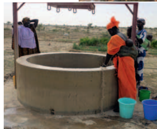
Wetlands are a valuable source of water, but are vulnerable to overexploitation and pollution. By Jane Madgwick