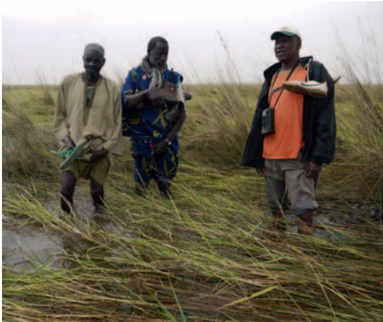
We empower communities to take action, such as in restoring this fish refuge and bourgou field in the Inner Niger Delta. By Jane Madgwick

Wetlands International employs a variety of strategies to enable different sectors of society to take action to address wetland-related issues. Instead of controlling and managing wetland areas ourselves, we play a catalytic approach. For instance, by providing knowledge, building local capacity and opening up access to financing opportunities, we enable communities to restore local wetlands that provide them with services. As well as being designed to provide local benefits to biodiversity and people, our field projects also aim to act as demonstration projects - to both test and illustrate approaches so that others can see them working and be motivated to try similar approaches in their own situation.