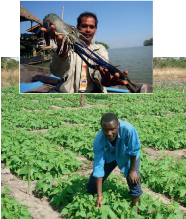
Wetland conservation and livelihood improvement can go hand in hand, as we demonstrated in Thailand (By Wetlands International Thailand) and Malawi (By Emma Greatrix)