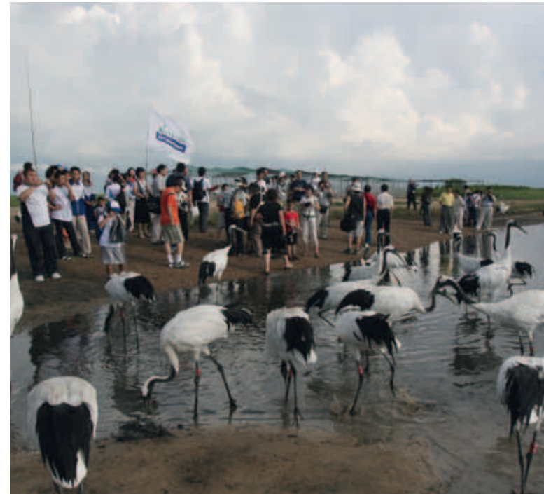
Awareness raising on cranes in China.

Wetlands International will continue and strengthen its efforts as a key player in the Waterbird Monitoring Partnership which, through the annual International Waterbird Census (IWC) and other special counts, collects and analyses data on population size and trends. The IWC data provides a valuable basis for setting conservation priorities for waterbird populations and the wetlands on which they depend, including setting