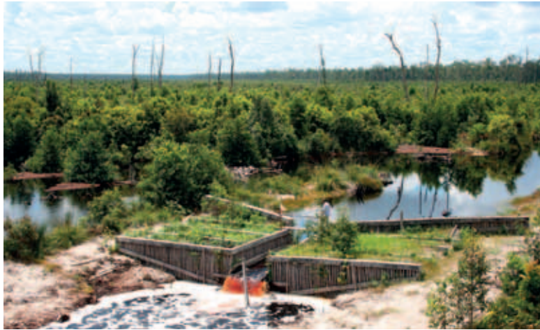
Peatland restoration, such as here in Central Kalimantan, Indonesia, has huge benefits for mitigating climate change as well as local livelihoods and biodiversity.

by the drainage of peat soils and other carbon rich wetlands to support advocacy for policy change. We aim to influence new international climate policies such as REDD and the follow up to the Kyoto-Protocol so that they to include provision for incentives to restore wetlands.