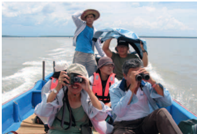
By Wetlands International Malaysia

a world where wetlands are treasured and nurtured for their beauty, the life they support and the resources they provide