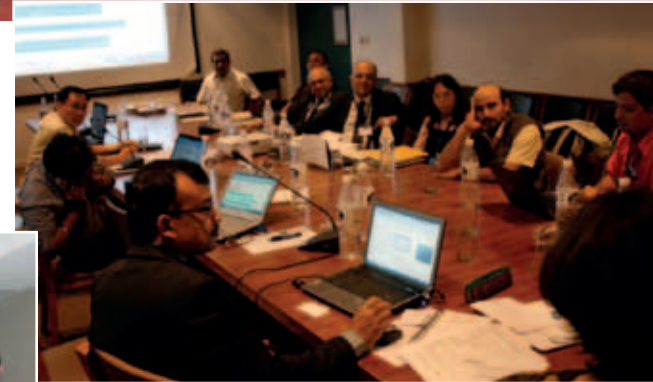
Regional strategy review meetings were held in Nairobi, Dakar, Buenos Aires, Ede and New Delhi. By Wetlands International