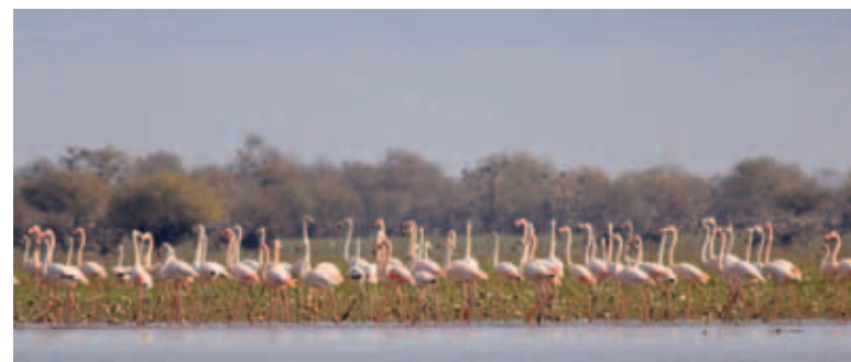
The International Waterbird Census involves thousands of volunteers every year counting millions of waterbirds, such as the Greater Flamingo at Krikini Lake, Greece.

Wetlands International works to improve the conservation status of biodiversity through initiatives that connect a wide range of stakeholders at all relevant scales, including sites, basins and flyways. We influence international and national priorities and action plans and engage local authorities, the private sector and local communities in taking action. Species-oriented approaches complement our site and habitat-based work. Our role is often to mobilise knowledge and expertise that can inform and guide this work. This involves collaborating with local people, scientific experts, partner organisations, national authorities and international conventions. Priorities for biodiversity conservation are also addressed through our work on livelihoods, water and climate change and are an important focus of our corporate partnerships.