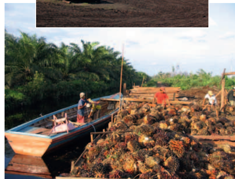
Peatlands are drained and mined in Belarus (By Hans Joosten) or converted into oil palm plantations in Indonesia and Malaysia (By Marcel Silvius)