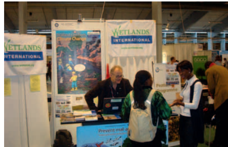
We bring specific wetland issues to the attention of national and global audiences, such as at the UNFCCC. By Marcel Silvius

Advocacy strategies can vary considerably according to the topic, target audience and decision-making process. Often, an advocacy plan involves action by staff from more than one of the Wetlands International offices, so as to reach different audiences in different regions and sectors. To influence institutions in places and arenas where Wetlands International has a limited presence, we work through policy networks, enabling other organisations (usually NGOs) to take up our case and use their well-developed networks and advocacy skills to achieve shared goals and outcomes. This has proved very effective, for example, in influencing EU institutions over recent years.