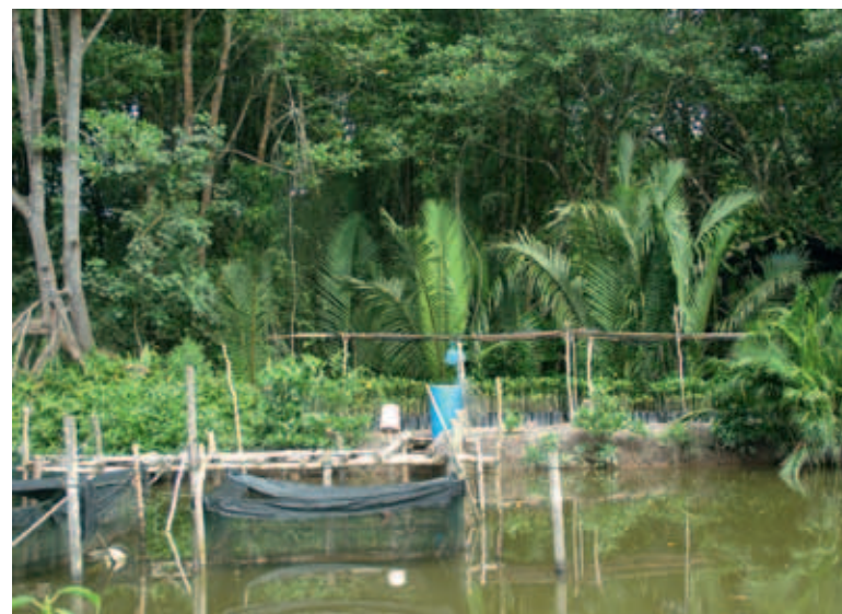
Through a silvofisheries approach we restore abandoned aquaculture ponds in Indonesia and Thailand. By Pieter van Eijk

Wetlands International works to address some of the key drivers of wetland loss, mainly in the agriculture sector. Examples include the loss and degradation of tropical peatland due to palm oil production, the impacts of large scale irrigated agriculture on water availability in dry regions and mangrove loss due to shrimp aquaculture. Wetlands International develops dialogues with multinational companies in the food and fuel sectors with the aim of influencing production system standards.