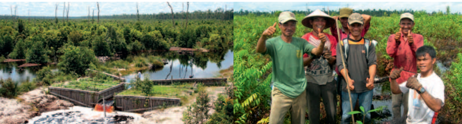
Community-led peatland rewetting and reforestation in Central Kalimantan, Indonesia.