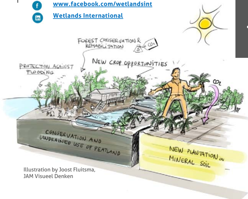
Illustration by Joost Fluitsma, JAM Visueel Denken