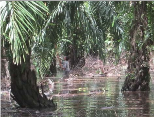
Flooded oil palm plantation in Aceh, by BPKEL and Deltares, 2011

What can be done to mitigate further subsidence and resulting flooding in the tropics and instead create sustainable peat landscapes?