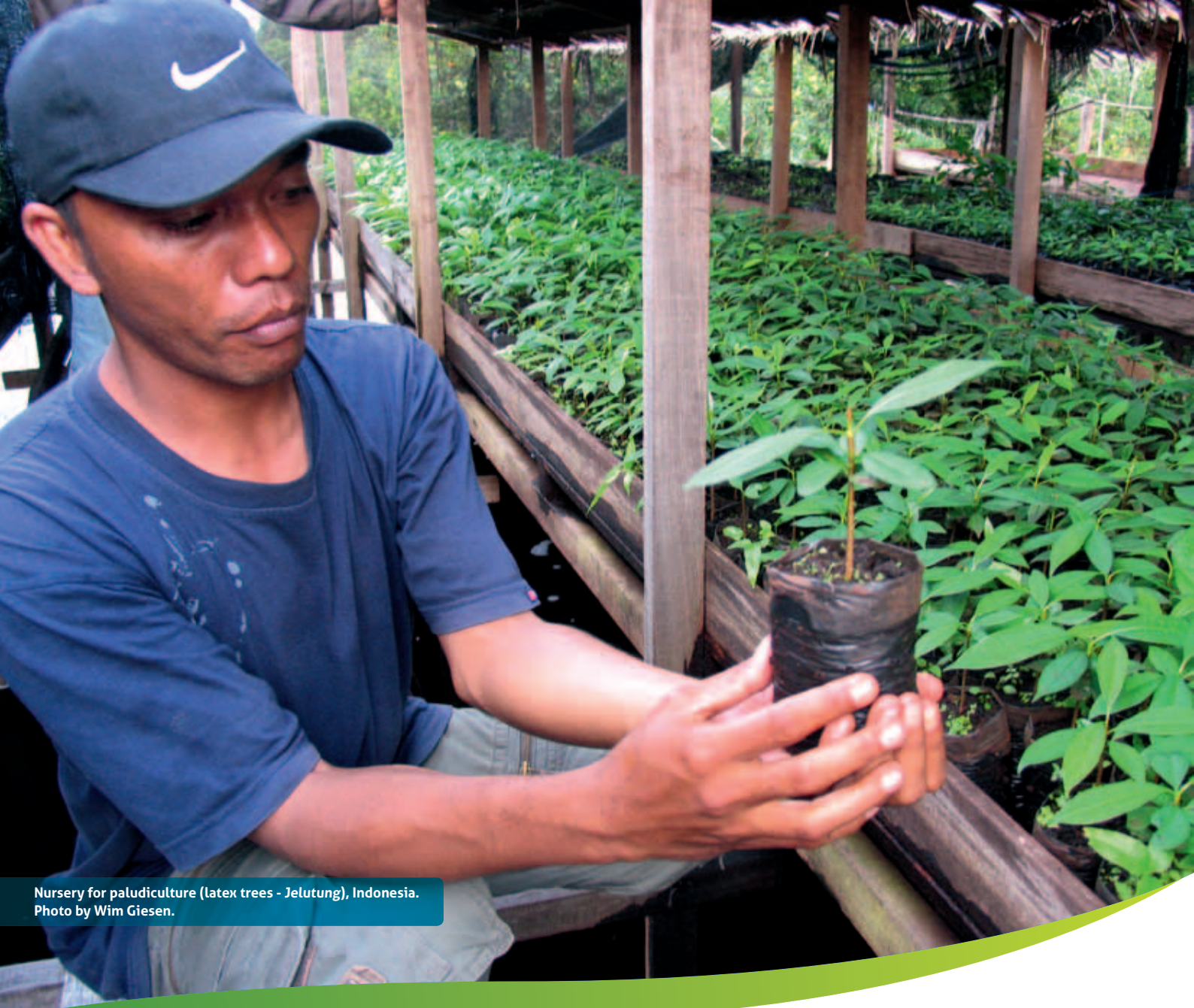
Nursery for paludiculture (latex trees - Jelutung), Indonesia.