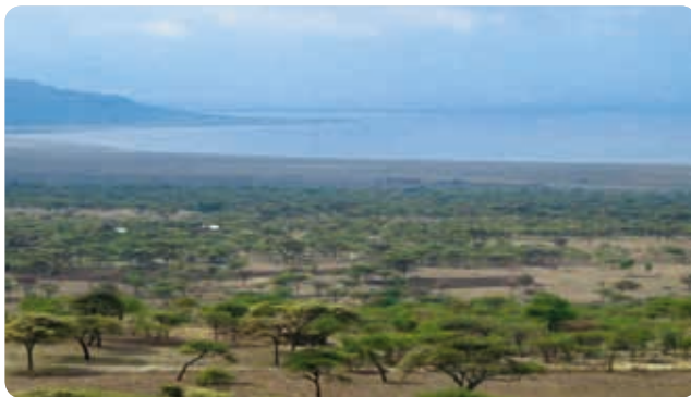
Lake Abijatta, Ethiopia

Lake Abijatta is the most important Critical Site in Ethiopia. Its existence is threatened by the overexploitation of water and degradation of the bushland in its upstream catchment. Together with the Rift Valley Lakes Basin Authority we convene communities, the private sector and knowledge institutes to ensure sustainable water allocation. We engage with the agricultural sector and communities to reduce water use and restore catchments.