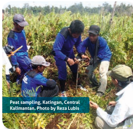
Peat sampling, Katingan, Central Kalimantan.

Implementation: safeguarding and restoring peatlands