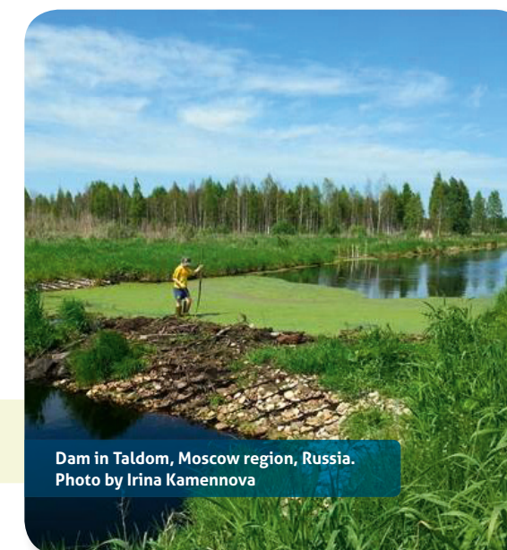
Dam in Taldom, Moscow region, Russia.

Capacity building for policy & practice and upscaling