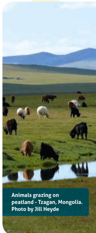
Animals grazing on peatland - Tzagan, Mongolia.