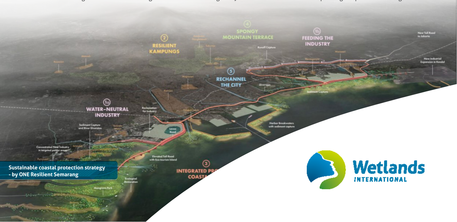
Sustainable coastal protection strategy - by ONE Resilient Semarang

The 'Building with Nature' approach for the upcoming harbour combines breakwaters with mangroves to protect the port. The mangrove growth is stimulated by depositing the port's own dredged material.