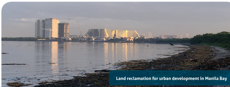
Land reclamation for urban development in Manila Bay

Together with our Partners for Resilience (PFR) alliance, we are engaged in the formulation of the Manila Bay Sustainable Development Master Plan to prevent land reclamation on mudflats and mangroves with prized biodiversity. We bring in knowledge on wetland and waterbird habitats as well as communities' voices into the planning process. The aim is to ensure these perspectives are respected in the sustainable growth of the Philippines' capital region.