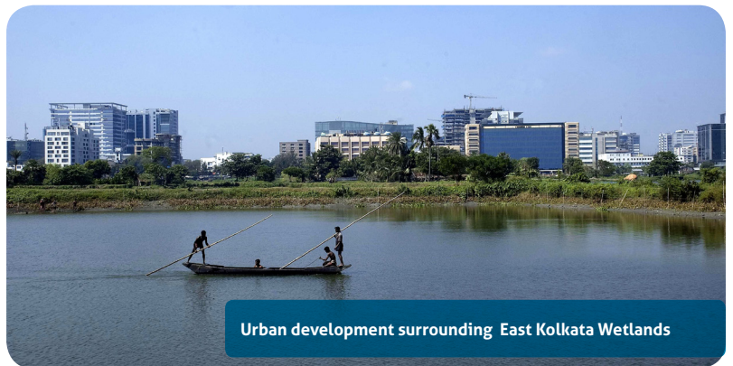
Urban development surrounding East Kolkata Wetlands

Our South Asia team's analysis of wetland loss concluded that urbanisation, contamination from sewage and fish farms are rapidly diminishing the East Kolkata wetlands, and in turn, their services for flood protection and water provision. To counter this, we developed a holistic wetlands management plan with stakeholders to conserve the ecosystem and allow integration of ecosystem services and biodiversity values in the city's urban and suburban planning. This resulted in an institutional framework for their wise management.