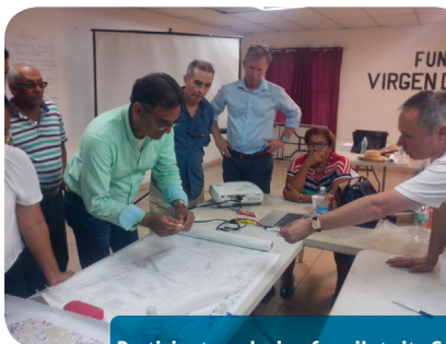
Participatory design for pilot site Santa Inés

We coordinated the Panama Dutch Water Dialogues directed at solutions to frequent urban flooding in the Juan Díaz watershed in Panamá City. Together with the Municipality and Dutch water experts, we developed a vision while ONE Architecture piloted the design for one key area. We also developed new regulations to prevent flood risk that are to be adopted by the new municipal administration. Next step is the participatory design and building of flood risk reduction infrastructure for the entire middle basin financed by a loan from Inter-American Development Bank.