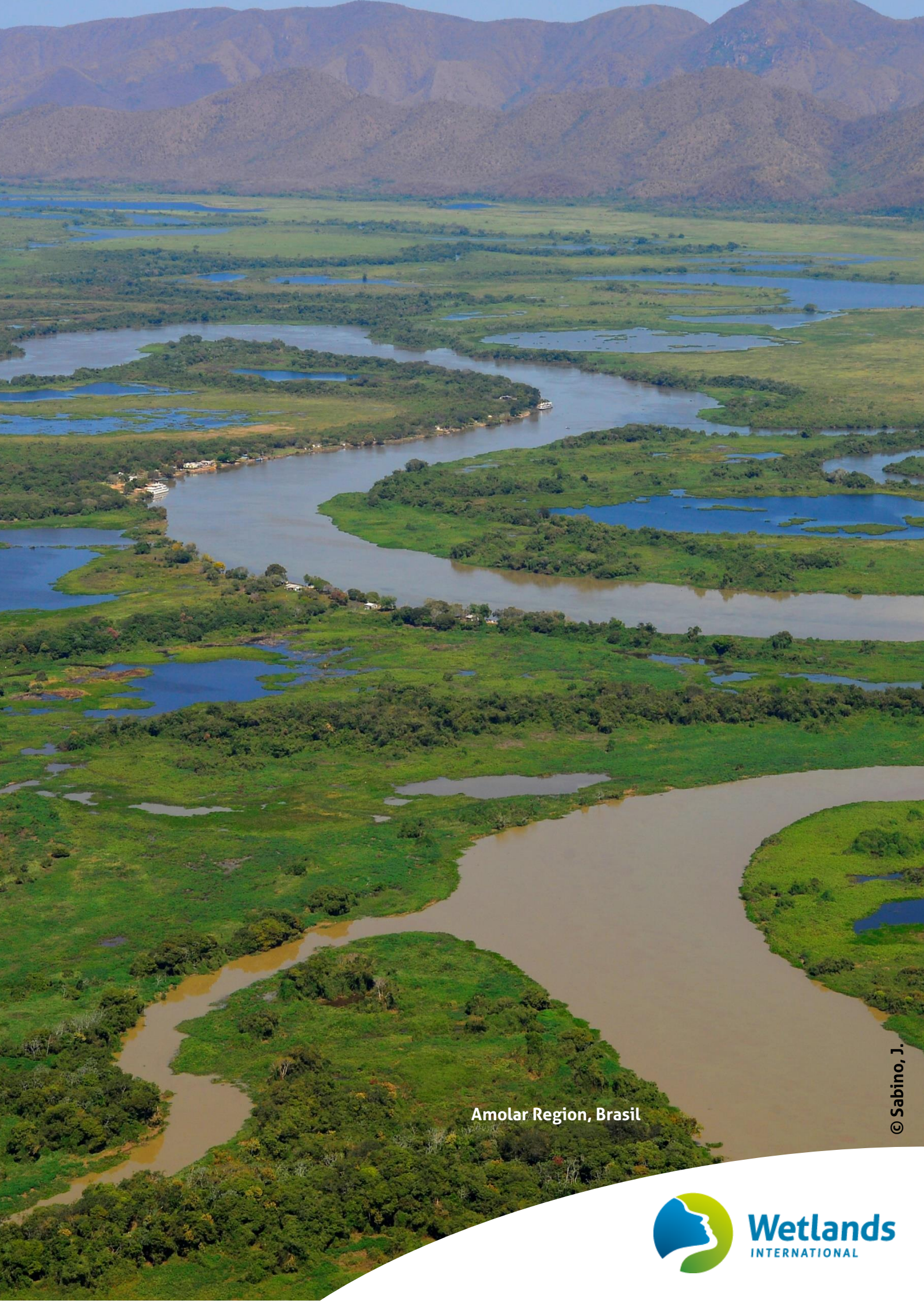
Amolar Region, Brasil